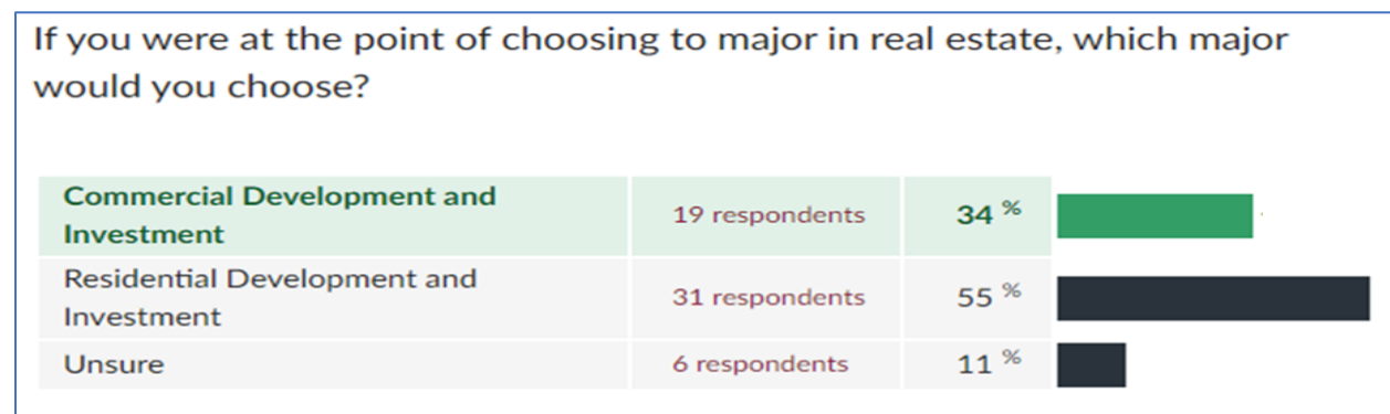
Table 3. Commercial/Residential Choices by Students in the Real Estate Studio Course